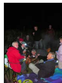
A breadcrumb sponge and spider crab typical of the Menai Strait ; Greater Dogfish / Catshark Eggcases, South Llŷn ; The unusual White Lace Sponge, Clathrina coriacea, on Porth Ysgadon Outer Reef ; Another typical Menai Strait scene, Dahlia anemones and spider crab ; Big Seasearch Weekend BBQ, Porth Ysgadon, North Llŷn.