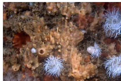
Anemones and sponge on the J E Layne