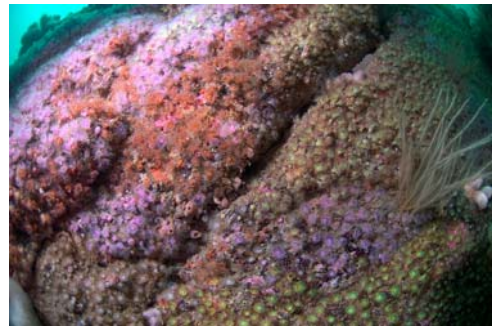
Walls covered with jewel anemones.

covered in jewel anemones with an abundance of life including other anemones, hydroids, sponges and on the ledges and between boulders frequent sea fans. The fans were generally in good condition. Although an area well fished by sport fishermen and small commercial boats there was little evidence of fishing debris.