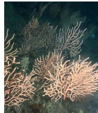
Healthy sea fan forest on the Eddystone reef.

The reef top was at about 14m, kelp covered and then dropped with ledges and walls to below 30m. The walls were well covered in cnidarians and sponges with frequent sea fans. In one area there was an "amphitheatre" containing a small forest of sea fans. The fans were in good condition and little evidence of fishing debris.