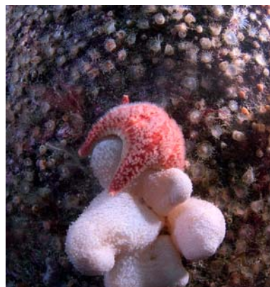
Red cushion star Porania pulvillus