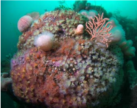
Mixed turf at Hand Deepes.

Hand Deepes is a set of five pinnacles (or fingers, hence the name) rising to within 7m of the surface. The bedrock drops steeply with sheer walls, ledges and gullies to over 50m. In places there are large boulders.