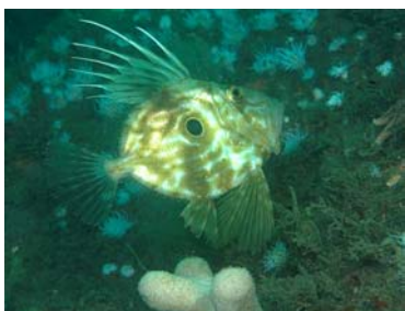
There is always a John Dory there!

Although extensively dived there have been no Seasearch survey records from this wreck. The site is well known for its population of sea fans, which grow on the main structure of the wreck and also on smaller pieces of wreckage lying on the seabed a few metres distant. The water at this site is generally less clear than further offshore although on this occasion visibility was up to 10m around the outside of the wreck.