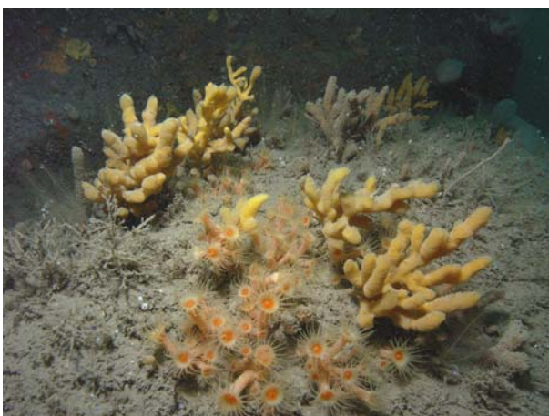
H. subdola & P. axinellae Chris Wood

Dive 1. Pen Brush A rugged rocky reef with steep cliff walls and deep gullies. The rocks were dominated with a high diversity of sponge species with 20 species recorded, particularly common were Homaxinella subdola and Axinella damicornis . Patches of yellow cluster anemone, Parozoanthus axinellae were found on the walls and on exposed areas mussel beds mixed in with kelp park. Unusual crabs found were the sponge crab, Dromia personata and the spider crab, Hya araneus . Leading away from the reef was a cobble/gravel slope with occasional potato crisp bryozoan, Pentapora foliacea and sightings of the curled octopus Eledone cirrhosa .