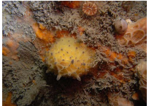
Nudibrach Doris sticta Chris Wood

Dive 3. Pwll Arian A magnificent site with steep rock walls and a deep swim through gullies. The site was described as 'a yellow site' as almost everything recorded was yellow! The yellow cluster anemone, Parazoanthus axinellae was super abundant carpeting the rocks and again like many of these sites a high diversity of sponges recorded including a large patch of the mashed potato sponge Thymosia guernei . Hydroids were also abundant with the common antenna hydroids, Nemertesia antennina and N. ramosa both present along with Aglaophenia sp and the herring bone hydroid Halecium halecinum , most notable was patches of the indian feather hydroid, Gymnangium montagui . Six species of nudibranch were recorded including two sightings of the rare Okenia elegans . The most notable crustacean were several baby crayfish, Palinurus elephas hiding in small crevices.