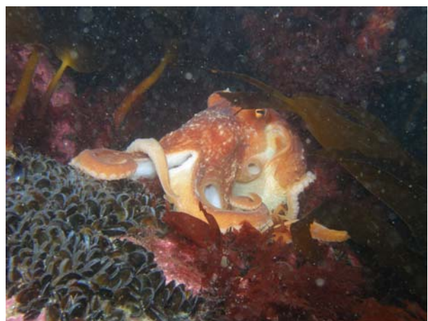
Mussel bed with E. cirrhosa